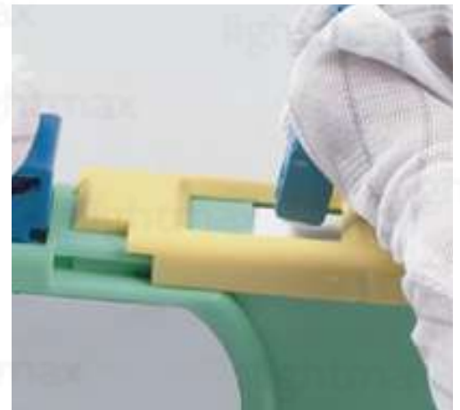
Cleaning of connectors SC, FC, ST, LC, MU, MPO