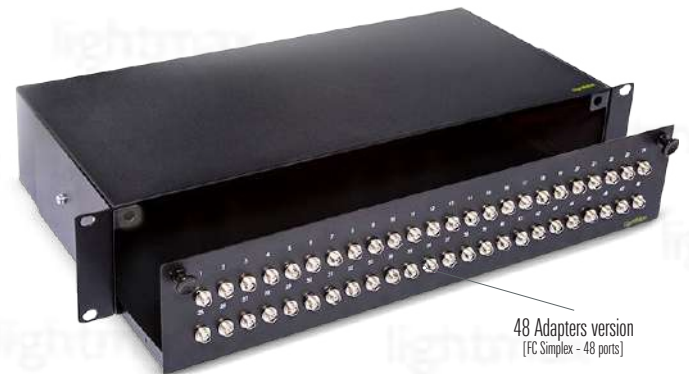
48 Adapters version [FC Simplex - 48 ports]