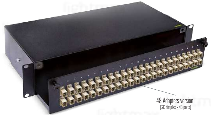
48 Adapters version [SC Simplex - 48 ports]