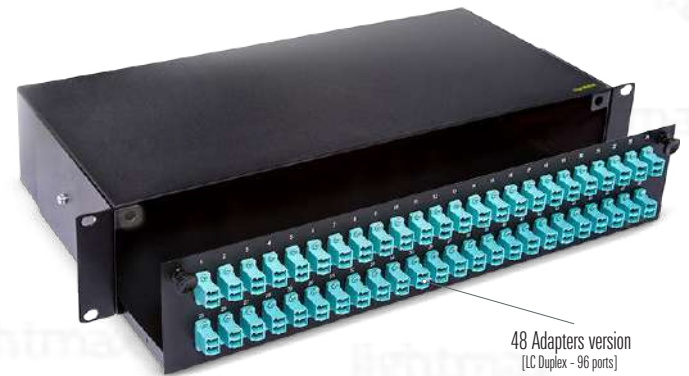
48 Adapters version [LC Duplex - 96 ports]